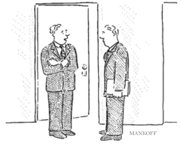
"Oh, can't complain, but I do."